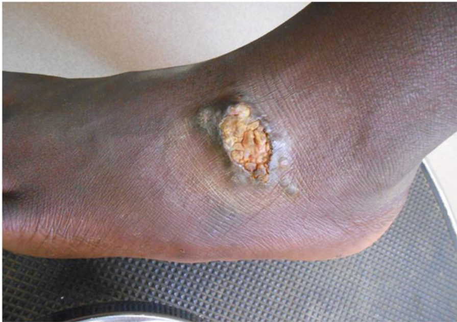
Figure 2: Ulcerative crusty lesion of the back of the foot with a halo of Faye

From a therapeutic standpoint, local infiltration based on Glucanthime was performed in 52.4% of cases (n = 22). Antibiotic therapy was started in 81% of cases (n = 34), dominated by metronidazole in 69% of cases (n = 29). Three (3) patients received topical corticosteroid therapy, and four (4) received antihistamines.