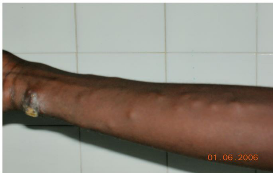
Figure 4: Pseudo-sporotrichosis (stepped) form of the forearm

The average duration of progression was 63 days, with extremities ranging from 30 to 180 days. Bacterial superinfection was found in 46.5% of cases ( n = 20 ), and an schematization in 9.5% ( n = 3 ). One (2.3%) patient presented side effects such as headache, myalgia, and increased serum creatinine after local injection with Glucanthime. All lesions were healed, leaving an indelible scar in 100% of cases.