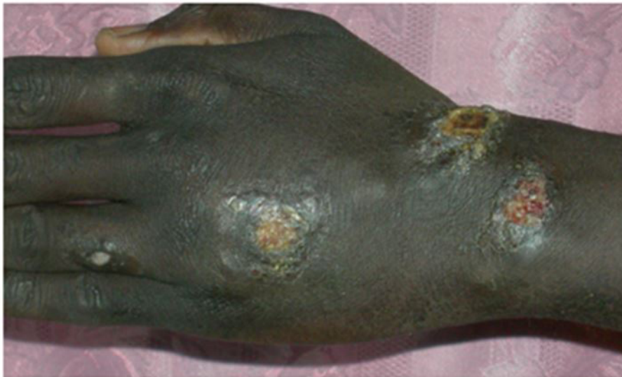
Figure 3: Crusty ulcerative lesions on the back of the hand