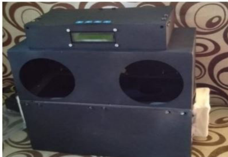
Figure 3: Experiment Setup