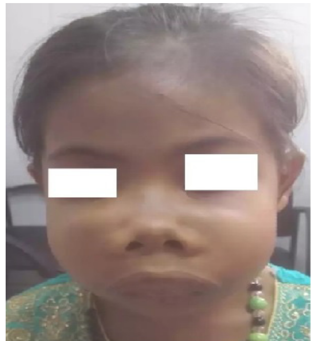
Figure 1. Frontal view of patient

“Cherubism” was first coined and documented in 1933 by Dr. W. A. Jones of Kingston, Ontario, describing a case of three siblings of the same family of Jewish Russian heritage. 1 It is a self-limiting disease and rarely apparent before the age of two years. It occurs in children. It is a non-neoplastic disease of the bone characterized by bilateral swelling of cheeks due to bony enlargement of jaws that give the patient a typical ‘cherubic’ look. Beginning in early childhood, both the lower jaw (the mandible) and the upper jaw (the maxilla) become enlarged as the bone is replaced with painless, cyst-like growths. These growths give the cheeks a swollen, rounded appearance and often interfere with normal tooth development. In some people, the condition is so mild that it may not be noticeable, while other cases are severe enough to cause problems with swallowing, breathing, speech, and vision. Enlargement of the jaw usually continues throughout childhood and stabilizes during puberty. The abnormal growths are gradually replaced with normal bone in early adulthood. As a result, many adults have a normal facial appearance in spite of having cherubism bony features in childhood.