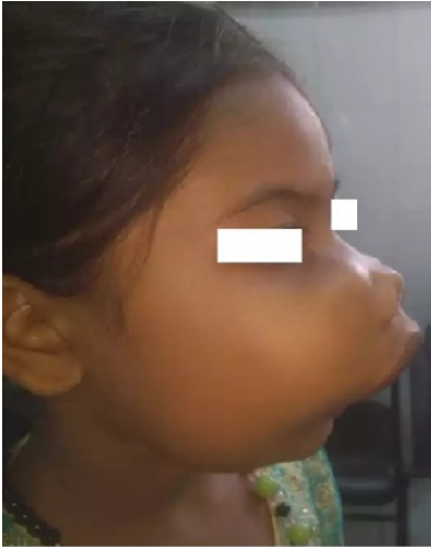
Figure 2: Lateral view of patient

An 8-year old girl presented to us in the maxillofacial department of Bangabandhu Sheikh Mujib Medical University with the complaints of bilateral facial swelling for the last 5 years. The patient's parents stated that they first noticed the swelling when she was 3 years of age. It presented as a small swelling of the mid-face and gradually began to grow.