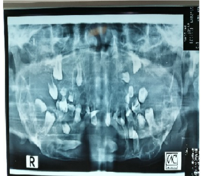
Figure 4. Orthopantomogram of patient

The patient had no difficulties in eating swallowing or speech and ocular examinations revealed no abnormality.