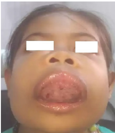
Figure 3: Intra-oral view

On examination, large bilateral symmetrical expansion is evident affecting the mid-face extending from the malar prominence to the angle of the lip. There is the obliteration of the nasolabial fold and an appearance of flattening of the nasal bridge and flaring of the nostrils. Profile of the patient revealed bilateral swelling of the lateral aspects of the lower third of the face. The pathologies were firm to hard on palpation, non-tender, with no distinct outline. They were not tender.