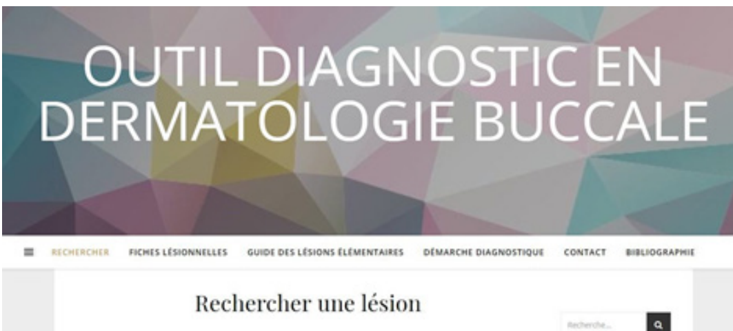
Figure 4 : Menu bar on the website's home page (screenshot).