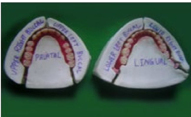
Figure 11: Teeth arrangement in Neutral Zone.