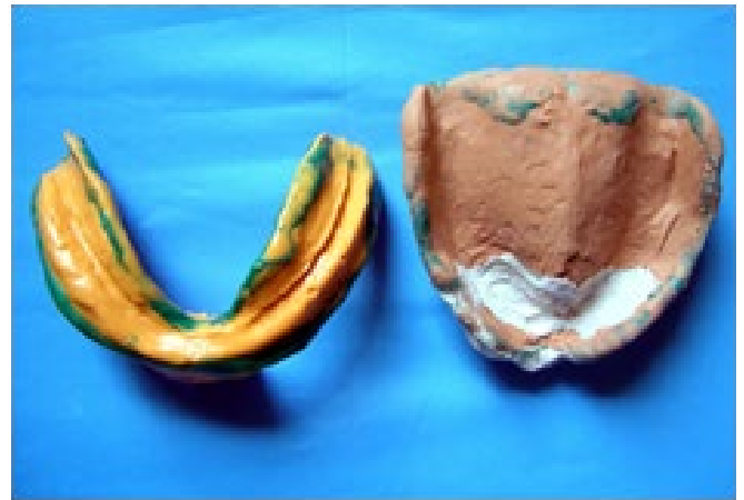
Figure 8: Final Impression.

After removing spacer, the maxillary wash impression using Zinc Oxide Eugenol impression paste was made. A window was made on the marked area for flabby tissue & again verified intra-orally. Paint Impression Plaster on the area of flabby tissue using hair brush to record the tissue in most passive form so that distortion of the tissue can be avoided. After setting of impression plaster, the entire tray was removed from maxillary arch. For mandibular ridge, after removing spacer, tray adhesive was applied on tissue surface & allowed to dry for 10 minutes. Then, light viscosity addition silicone was loaded on the tray & immediately wash impression was made & material is allowed to set for 4 minutes (Figure 8).