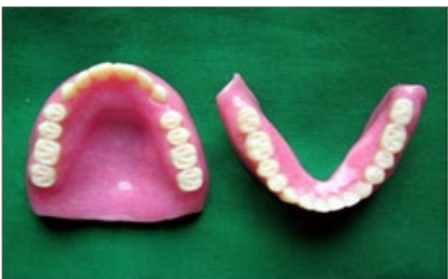
Figure 13: Finished complete denture.