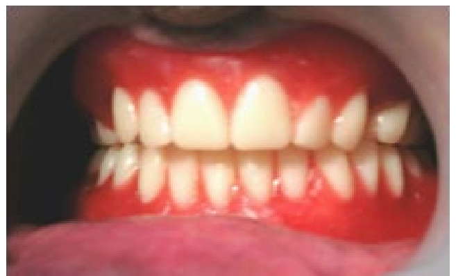
Figure 12: Intraoral view of waxed up denture during Try-in.