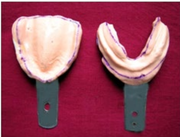
Figure 7: Primary Impression made by Irreversible Hydrocolloid.

After removing spacer, the maxillary wash impression using Zinc Oxide Eugenol impression paste was made. A window was made on the marked area for flabby tissue & again verified intra-orally. Paint Impression Plaster on the area of flabby tissue using hair brush to record the tissue in most passive form so that distortion of the tissue can be avoided. After setting of impression plaster, the entire tray was removed from maxillary arch. For mandibular ridge, after removing spacer, tray adhesive was applied on tissue surface & allowed to dry for 10 minutes. Then, light viscosity addition silicone was loaded on the tray & immediately wash impression was made & material is allowed to set for 4 minutes (Figure 8).