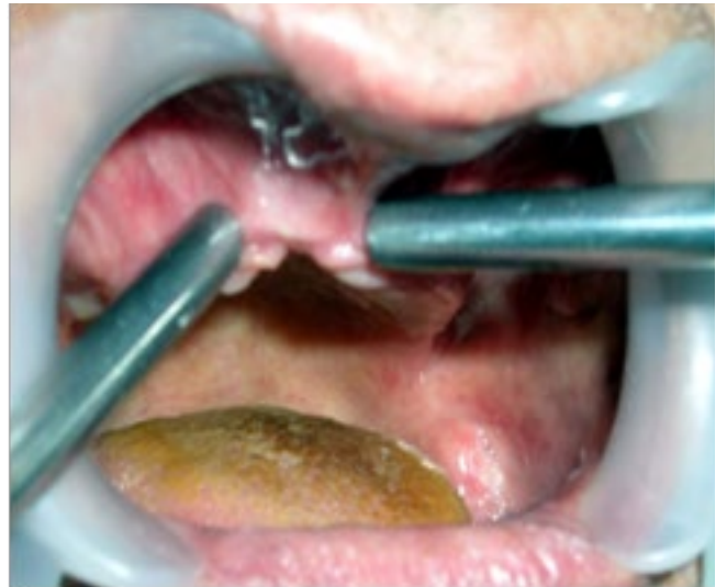
Figure 2: Maxillary Edentulous Ridge with Flabby Tissue.