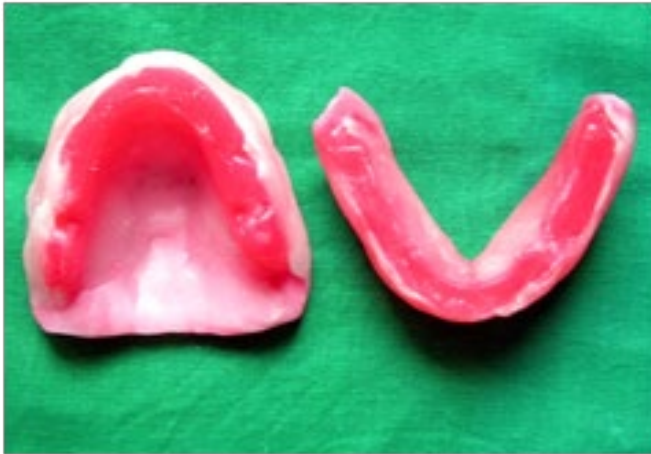
Figure 9: Rim with Neutral Zone Recording