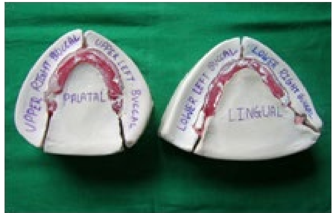
Figure 10: Neutral Zone Rim with plaster indices.