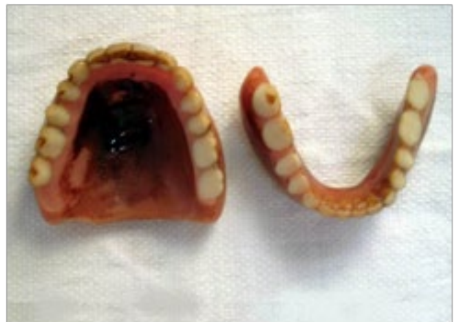
Figure 6: Previous Denture.