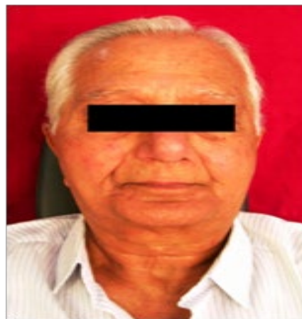
Figure 14: Post-operative Extra oral View.