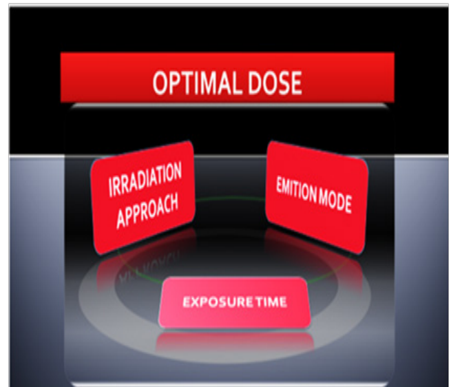
Figure.2 Schematic illustration of the methodical approach for choosing the optimal dose of laser radiation individually for each patient and for each stage of treatment

World literature provides information on scientific controversies and fluctuations at the recommended optimal dose of electromagnetic radiation on the human body [1,8]. It has been shown that tissue reactions are variable in nature under the influence of different physiological internal and external states in the dynamic self-regulating system of the human organism [3-6]. The current nature of the problem is determined by the direct relationship between therapeutic efficacy and biological factors such as total body reactivity, regenerative and reprocessing processes, oxidative and reductive potentials, regional and general blood flow, the presence of pathogenic associations of microorganisms and the neuromuscular regulation of the function [2, 7].