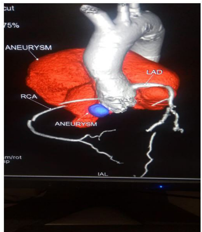
Figure 2: 3D reconstruction image- the aneurysm is seen compressing the right coronary artery(RCA) and left anterior descending artery(LAD)