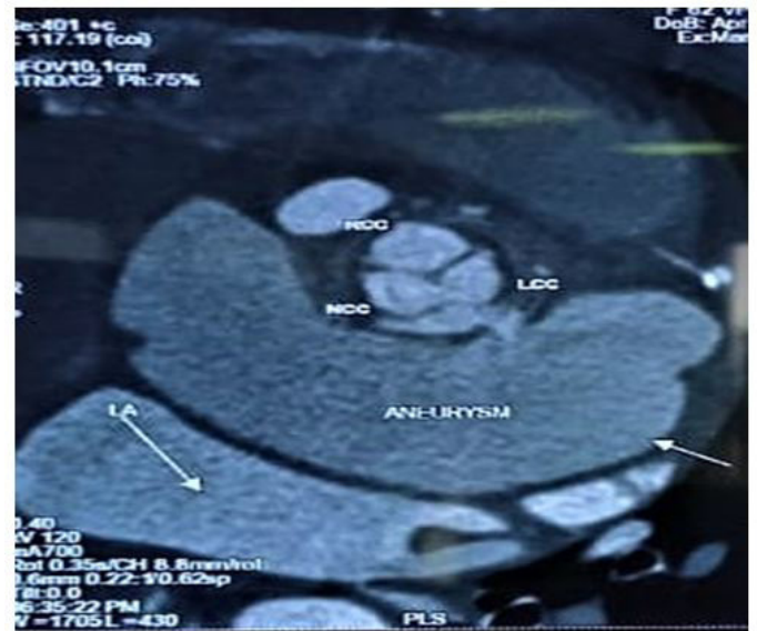
Figure 1: CT angiography image- a large aneurysm arising from the non-coronary cusp and compressing the left atrium(LA)