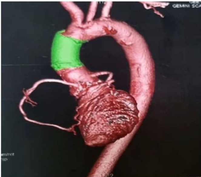
Figure 4: postoperative CT aortogram showing the vascular stent (green) in ascending aorta