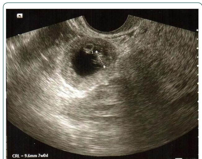
Figure 1: Trans-vaginal scan revealed an extra-uterine gestational sac with fetal echo and fetal heart activity seen.

Upon arrival, she was not pale. Her blood pressure was 126/72 mmHg and pulse rate was 88 beats /minute. Abdominal examination revealed tenderness over supra-pubic region with rebound tenderness but no guarding. Upon bimanual examination, the uterus was anteverted, normal size and mobile. There was positive cervical excitation and both adnexae were tender. Bogginess was felt at the Pouch of Douglas (POD).