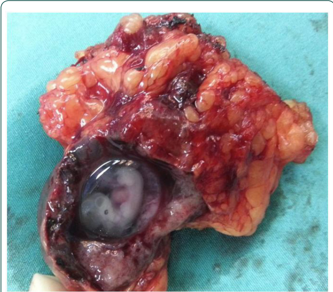
Figure 3: Omental pregnancy with fetal pole seen in side the intact sac

Post-operatively, she recovered well without any need for blood transfusion. Histo-pathological examination of the partial omentectomy specimen confirmed the diagnosis of primary omental ectopic pregnancy as the trophoblastic cells invaded into the omental tissue (Figure 4).